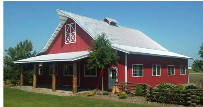
ASC Building Products is Proudly Distributed by: